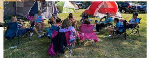
Bible Study @ Alive