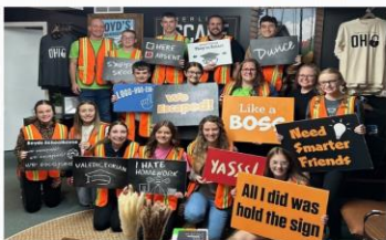
Youth Night @ Escape Room